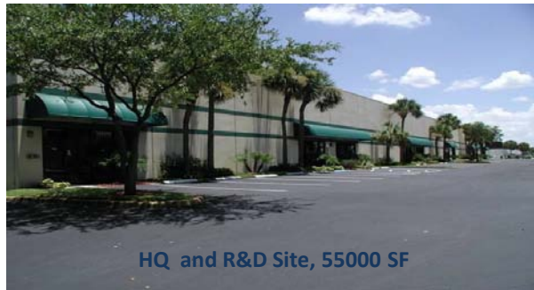
HQ and R&D Site, 55000 SF