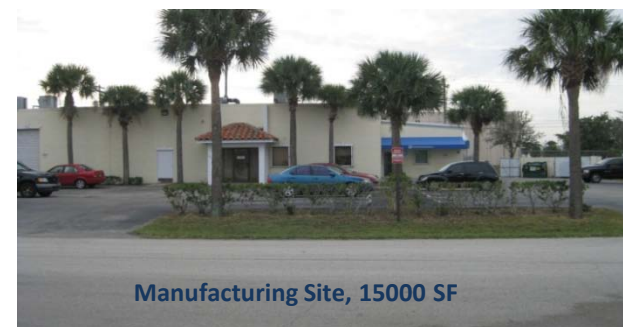
Manufacturing Site, 15000 SF